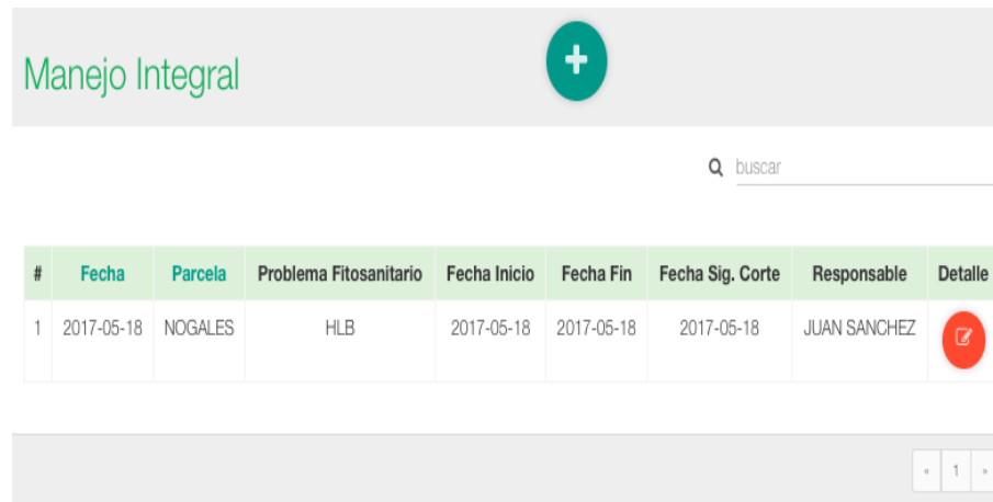
Figure 12. Manejo Integral.

Elaboración propia: Valencia et al, 2017.