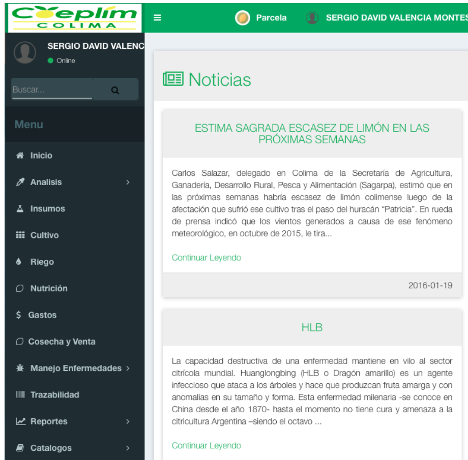
Figure 2. TraceLemon Menú principal.

Elaboración propia: Valencia et al, 2017.