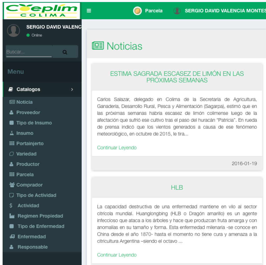
Figure 3. Catálogos de TraceLemon.

Elaboración propia: Valencia et al, 2017.