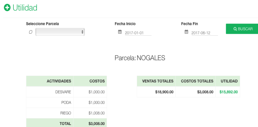
Figure 13. Utilidad por Parcela.