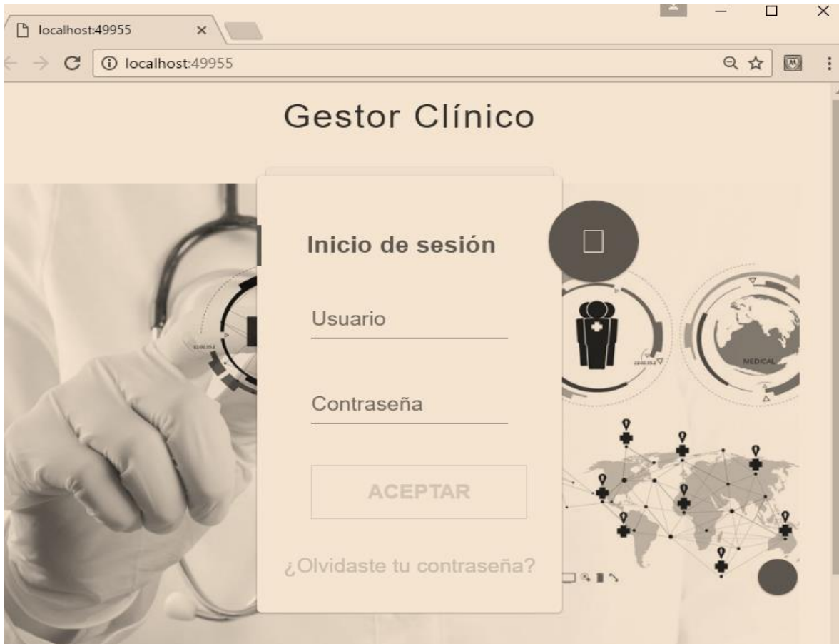
Figure 3. Clinical Manager Login

Figure 3 shows the login screen. In this screen the user and the password must be entered; If these data are correct the screen will automatically take the user to the patient screen, in which according to the user entered and the permissions of the patient will be available.